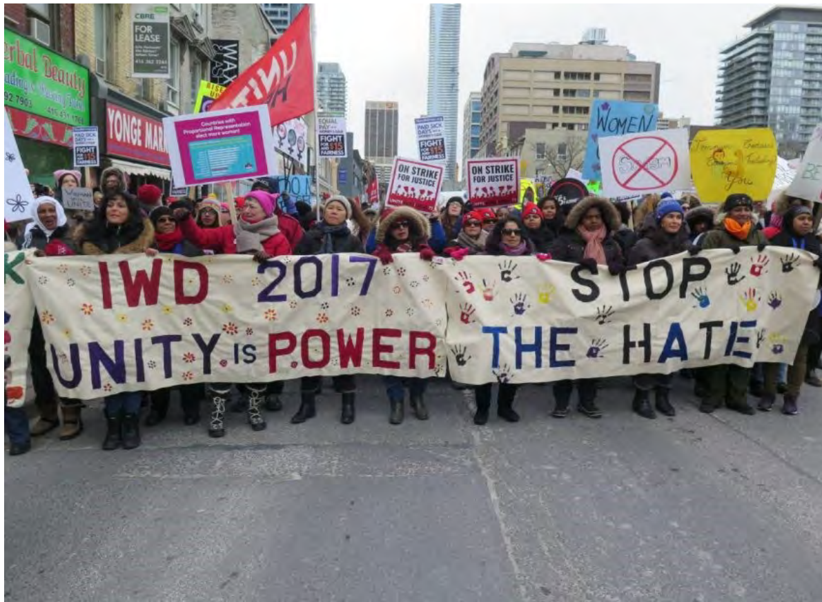
Women's Day Protest, Toronto, March 11, 2017