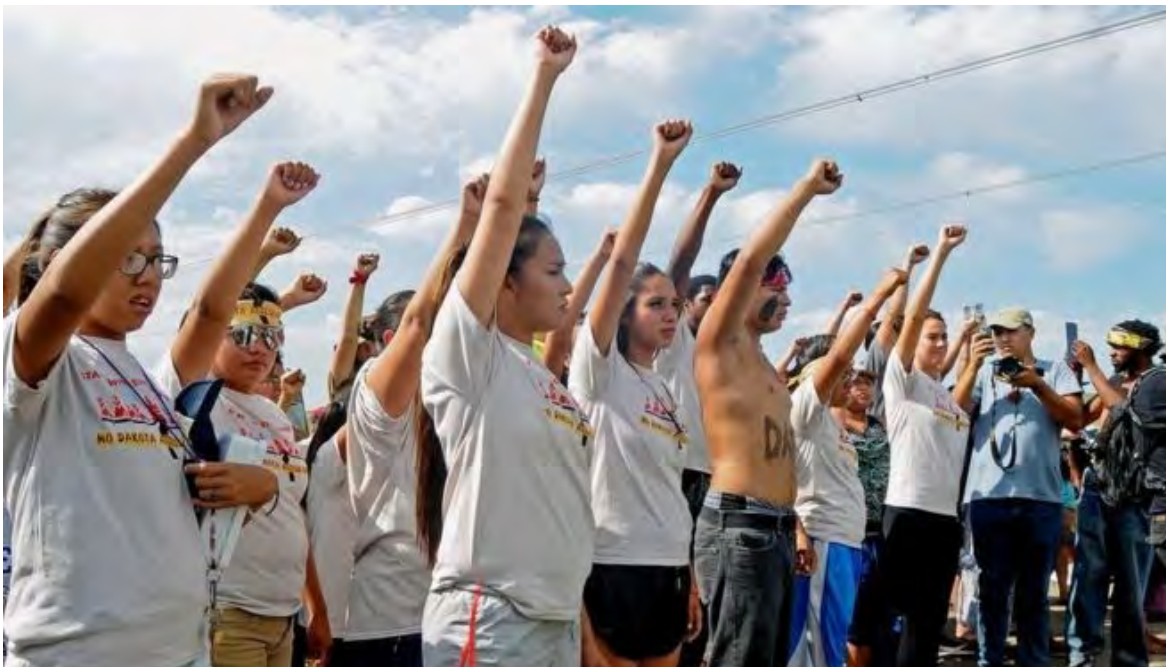
A group of Native American protesters halt work on the Dakota Access Pipe line North Dakota on August 16, 2016.

Many expressed the view that the legislation violated freedoms of expression, association and conscience. Its passage prompted even larger and more sustained demonstrations including a protest of over 100,000 people in Montréal on May 22, 2013.