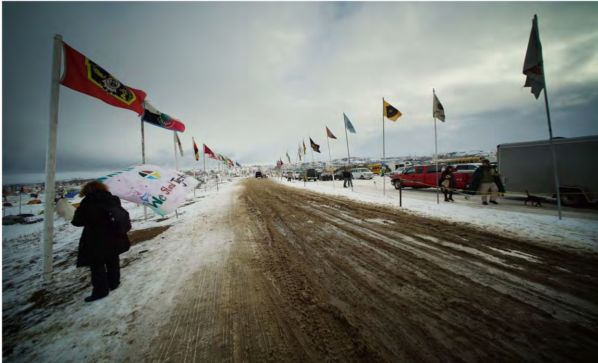
The oil pipeline protest site by the Standing Rock Reservation in North Dakota in November, 2016

On November 20, 2016 at a standoff near the Standing Rock encampment that lasted for more than six hours, police sprayed a crowd of roughly 400 protesters with water in temperatures hovering below freezing (photo below). Camp medics reported that hundreds were treated for hypothermia. Twenty-six people were hospitalized. National Lawyers Guild observers reported that several people were unconscious and bleeding after being shot by rubber bullets.