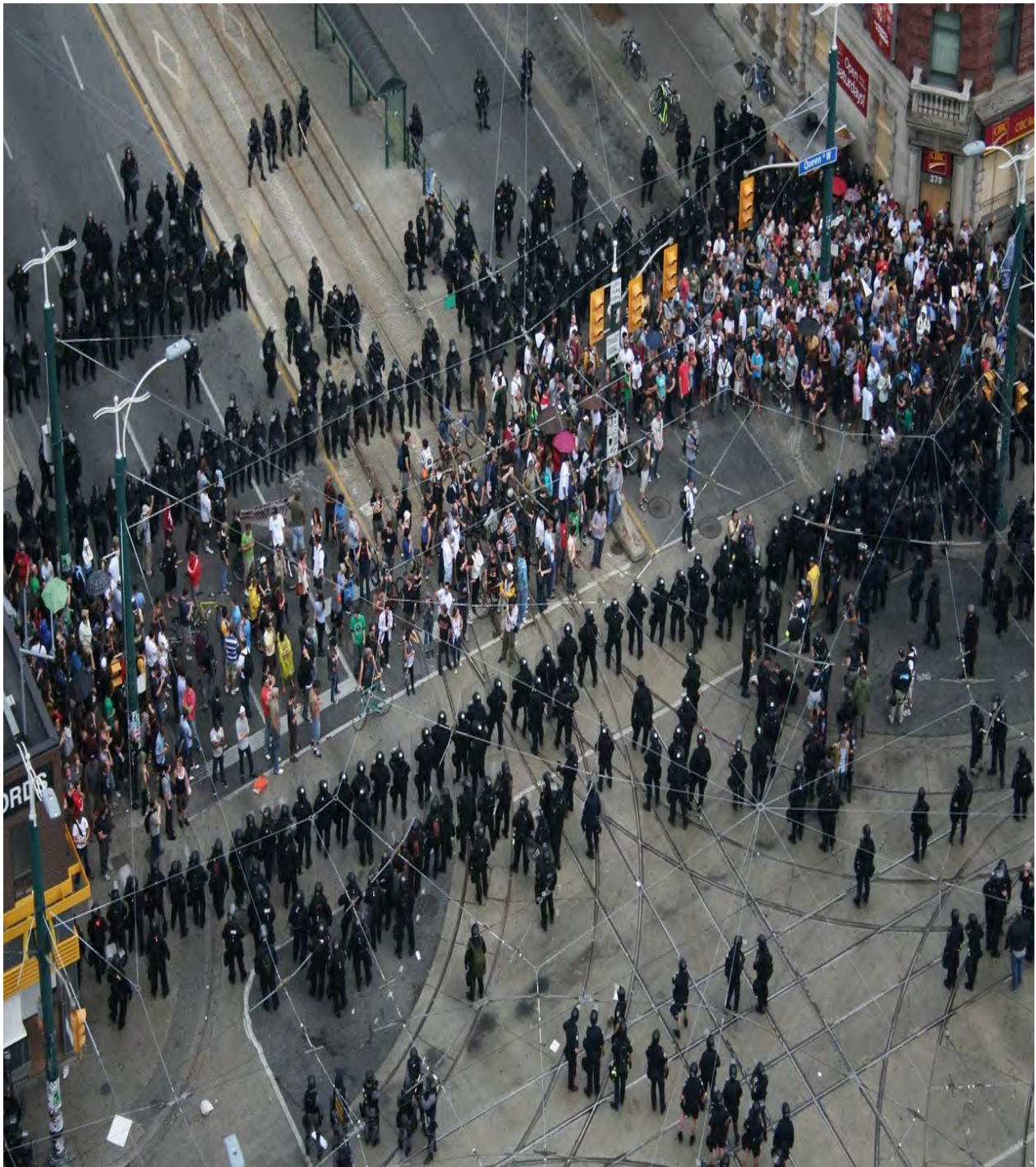
Kettling by riot police at Queen and Spadina during Toronto G20: 17 June 2010