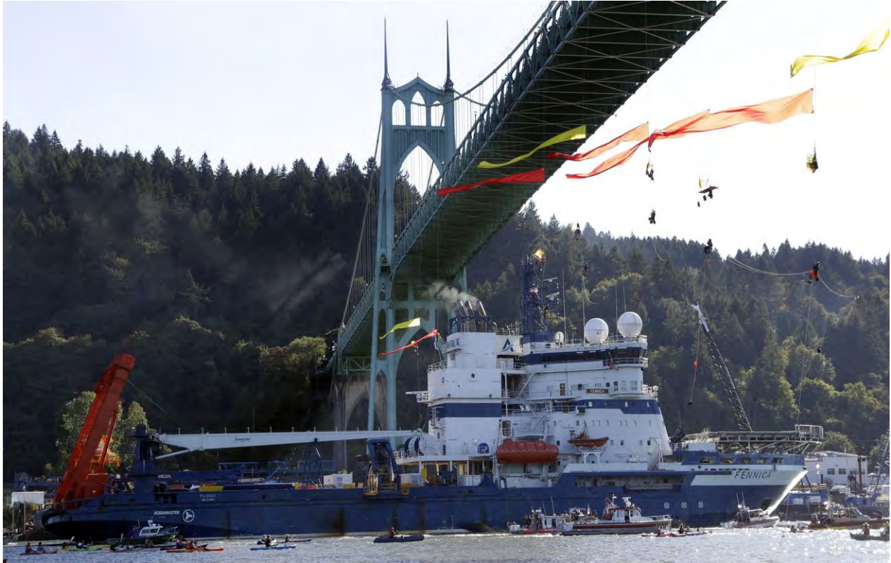
Greenpeace Protesters use Kayaks to encircle Greenpeace Activists Hanging from St. John's Bridge over the Willamette River, Portland, Oregon, to protest the departure of the Shell icebreaker Fennica en route to Alaska for Arctic Drilling, July 30, 2015.

Masters also have limited authority to lawfully detain, put people under custody, and even use force in in order to ensure the safety of a vessel and passengers. This is a power that can potentially be used against protesters who endanger vessels.