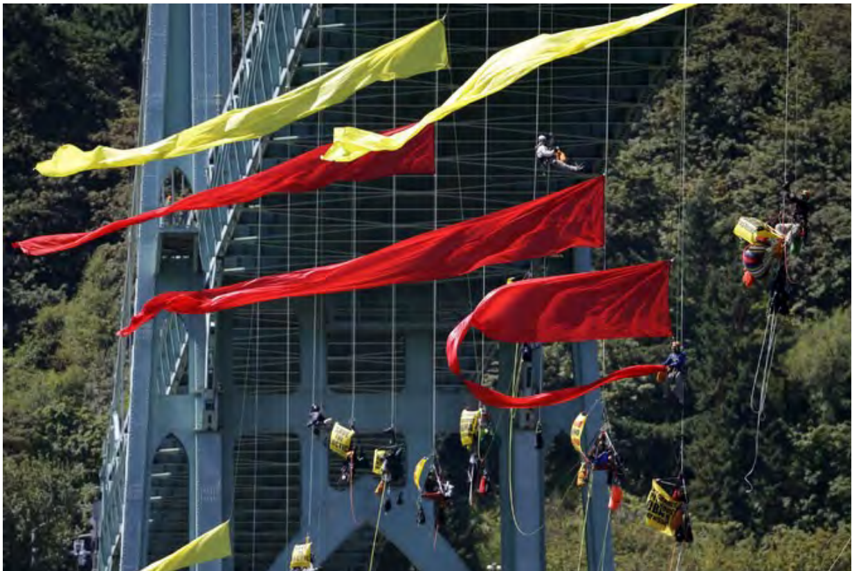
Greenpeace Activists Hanging from St. John's Bridge over the Willamette River, Portland, Oregon, to protest the departure of the Shell icebreaker Fennica en route to Alaska for Arctic Drilling, July 30, 2015

Finally, we welcome your questions, comments and criticisms. The e-mail address is lmcgrady@mcgradylaw.ca .