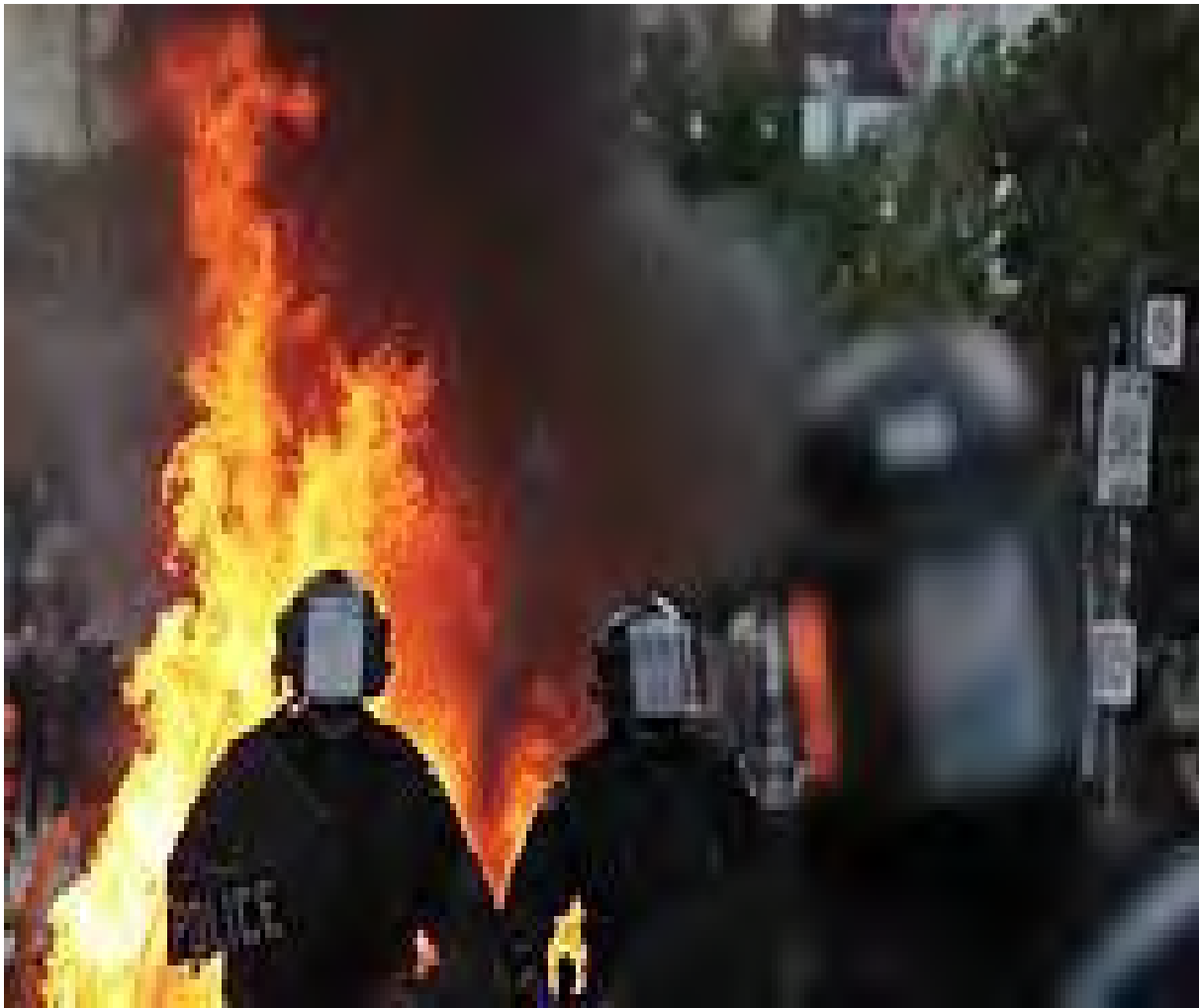
G-20 Bloc/police provoked riot – police in front of burning police vehicle, Toronto, June 26-27, 2010

This was the conduct engaged in and filmed in the G20 demonstration, which had been peaceful. A small number of black clad protesters – perhaps 100 – separated from the crowd and began torching police cars and then smashing windows. Then they removed their black outer clothing and blended in with the crowd of peaceful protesters. Some speculated that, as in the Montebello illustration, these violent demonstrators were agent provocateurs whose task it was to discredit the peaceful protesters and their objectives. The filmmaker – Joe Wenkoff - speculated that it was odd considering the 1.5 billion dollars spent on security, and the presence of approximately 20,000 police officers in the general area of the demonstration, that there wasn't a single police officer within blocks of the violence, which took place in one of the prime business areas in downtown Toronto and an area easily anticipated to be a magnet for this kind of violent demonstrator.