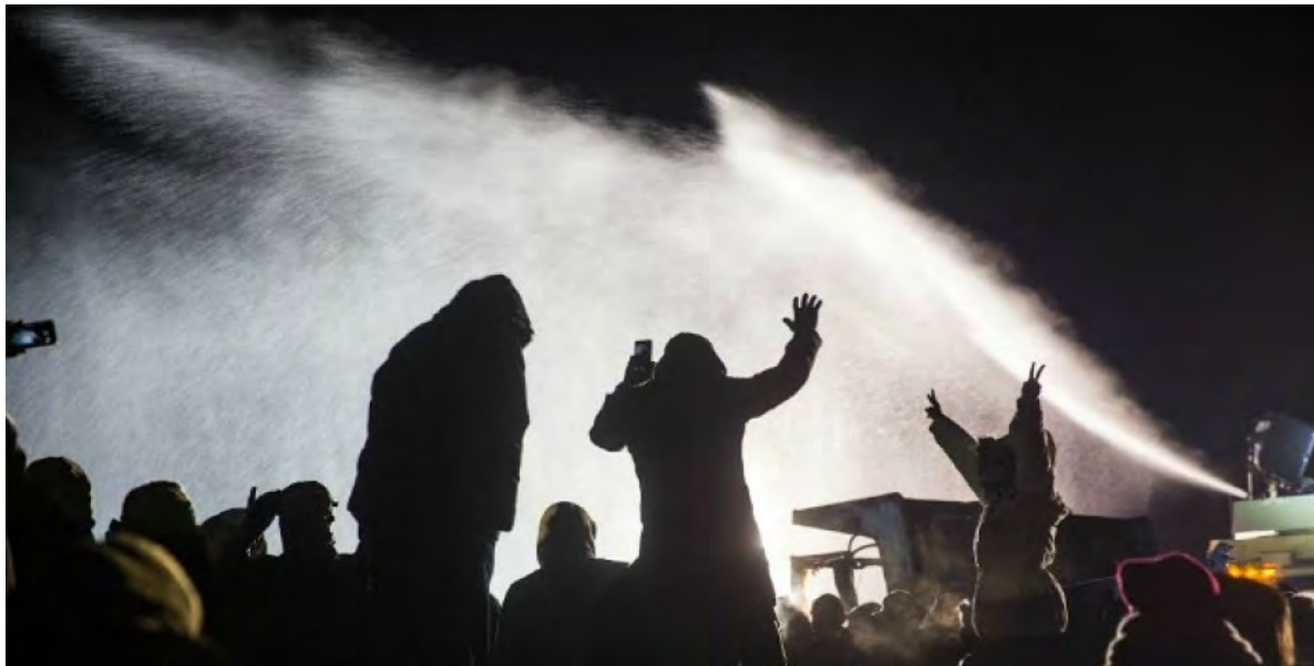
Fire hoses deployed on water protectors at the Dakota Access Pipeline protest.

On November 20, 2016 at a standoff near the Standing Rock encampment that lasted for more than six hours, police sprayed a crowd of roughly 400 protesters with water in temperatures hovering below freezing (photo below). Camp medics reported that hundreds were treated for hypothermia. Twenty-six people were hospitalized. National Lawyers Guild observers reported that several people were unconscious and bleeding after being shot by rubber bullets.