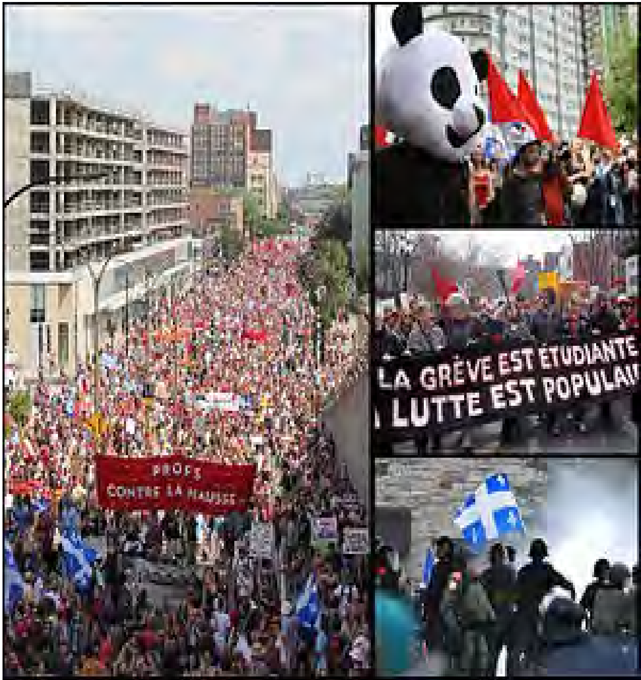
Québec Student Protests 2012