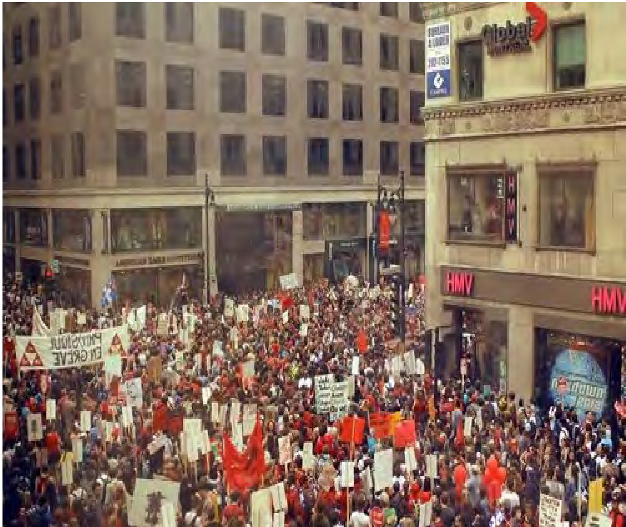
Student protest, Montreal, March 22, 2012.

The detention must be conducted in a reasonable manner. Investigative detention should be brief. There is no obligation on the detained person to answer questions.