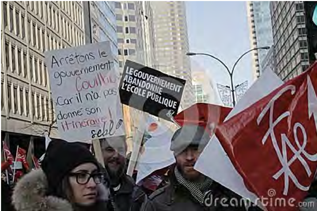
Montreal, Québec, Canada, 9 December 2015: Public-sector workers protest in Montreal - members of Common Front unions, including teachers and health care professionals.