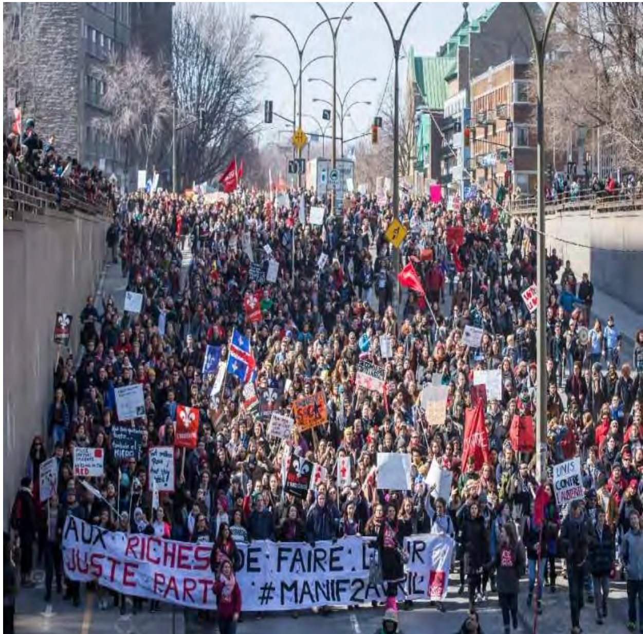
An anti-austerity demonstration in Montreal on Thursday, April 2, 2015.

The Ontario Court of Appeal reversed the decision of Justice Myers of the Superior Court of Justice. The appeal decision is a blueprint for the rights of protesters in these circumstances. The decision is a model of brevity and clarity. It deals with common-law police powers, freedom of expression, common-law liberty, and the relationship between performance of a duty for the public good and one's individual liberty.